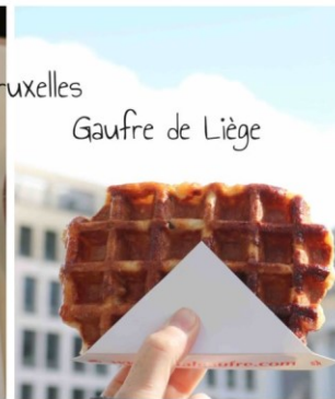
Gaufre de Liège