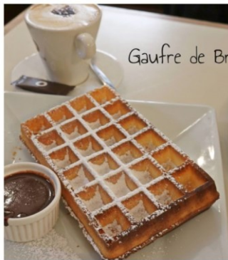
Gaufre de Bruxelles