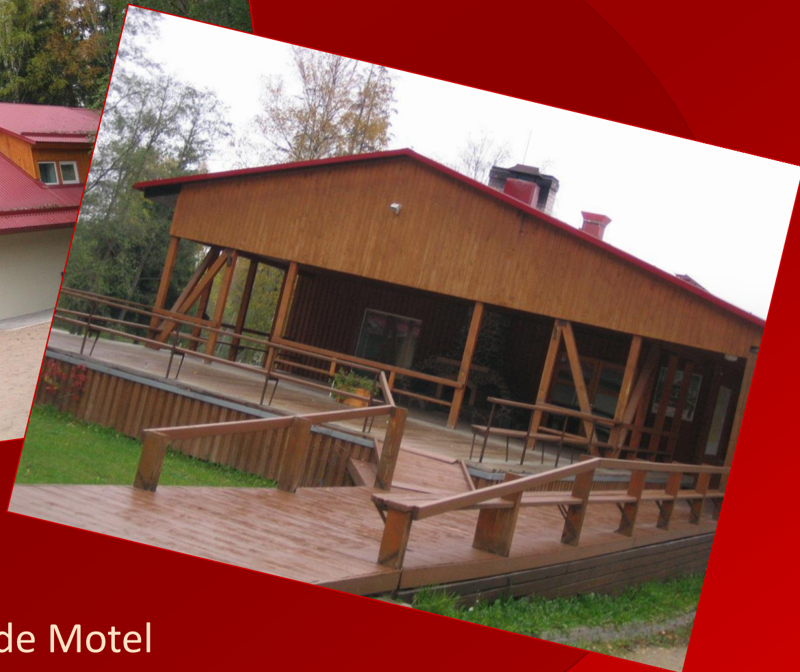
Arriving at Waide Motel