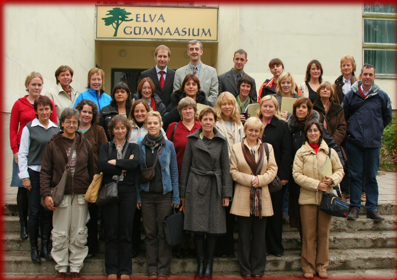
Our big and friendly group in front of Elva Gymnasium